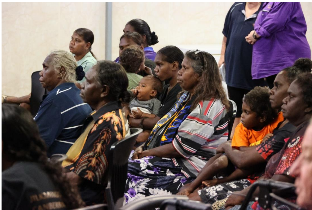
Image description: Audience members listening to the panel guests.