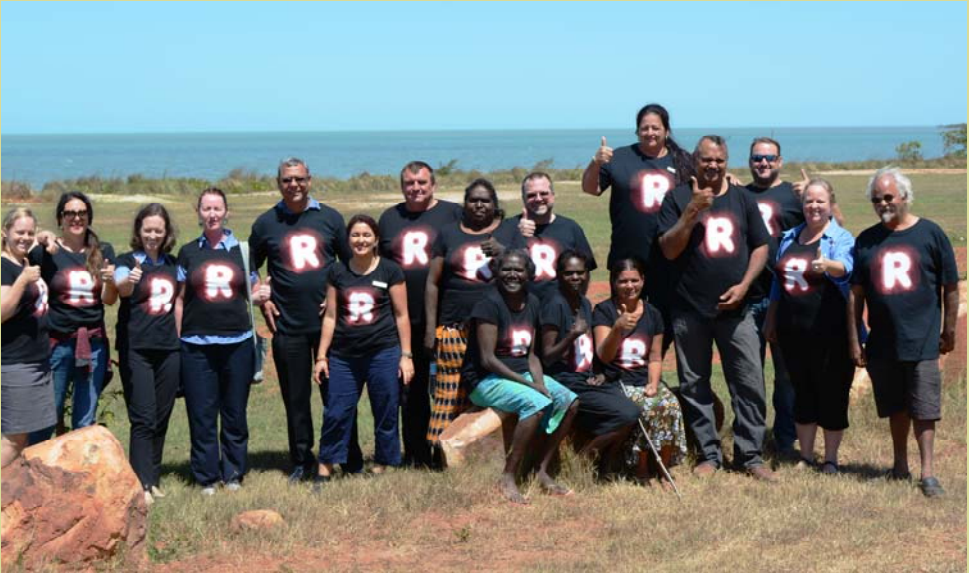
Community Barbeque in Numbulwar

Roper Gulf Regional Council's Elected Members, Executive and Governance Team in Numbulwar