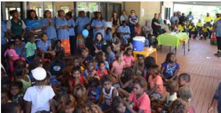
Below: Jilkminggan MUNs Team